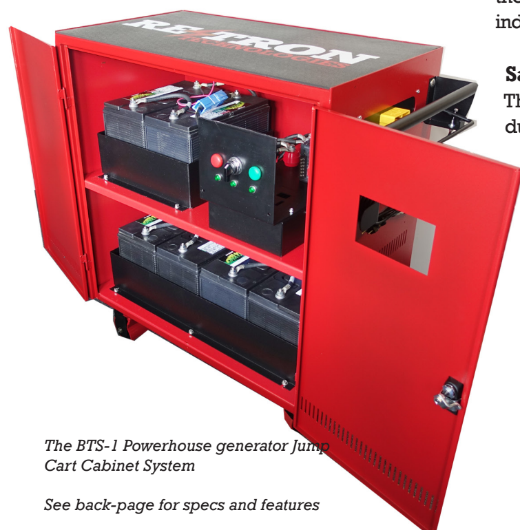
The BTS-1 Powerhouse generator Jump Cart Cabinet System