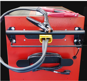
Top to bottom: Cabinet interior and control panel; Control handle, brake and jumper cable