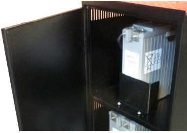
16V Side door opens for easy access