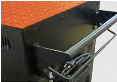
Control handle and brake