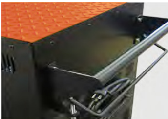
Control handle and brake