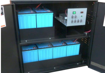
Easy access cabinet with removeable doors