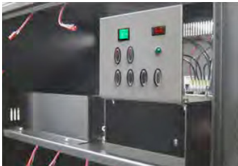
12V Control panel and storage area